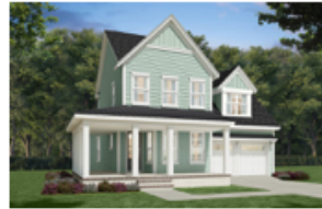
TOWSON - LOT 1691

By Brookfield Residential 2,663 sq ft 4 beds/3.5 baths Available Now