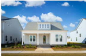
HUTCHINSON - LOT 1537

By Homes by Dickerson 2,600 sq ft 4 beds/3 baths Available Now