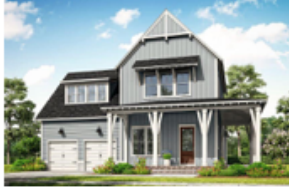
COOPER - LOT 1693

By Saussy Burbank 3,140 sq ft 4 beds/3.5 baths Available Now