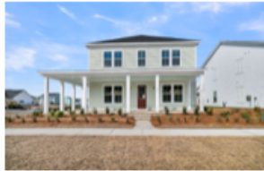
OVERTON - LOT 1684

By Ashton Woods 2,740 sq ft 4 beds/3 baths Available Now