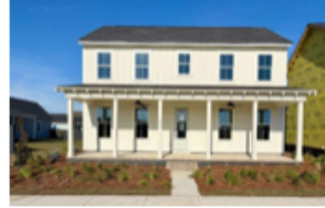
ANETO - LOT 1499

By New Leaf 2,550 sq ft 4 beds/4 baths Available Now