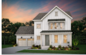
FOXFIELD - LOT 1695

For instance, dig into this selection of dreamy quick move-in homes designed for all kinds of healthy indoor/outdoor living.